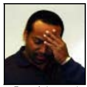
Fever, fatigue, and muscle aches are the first symptoms of HPS

In the United States, there has never been a case in which a person with HPS has given the disease to another person.