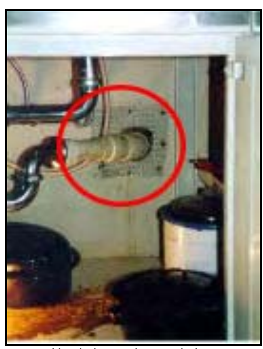
Use lath metal around pipes