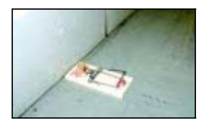
Place trap so it makes a "T" with the wall