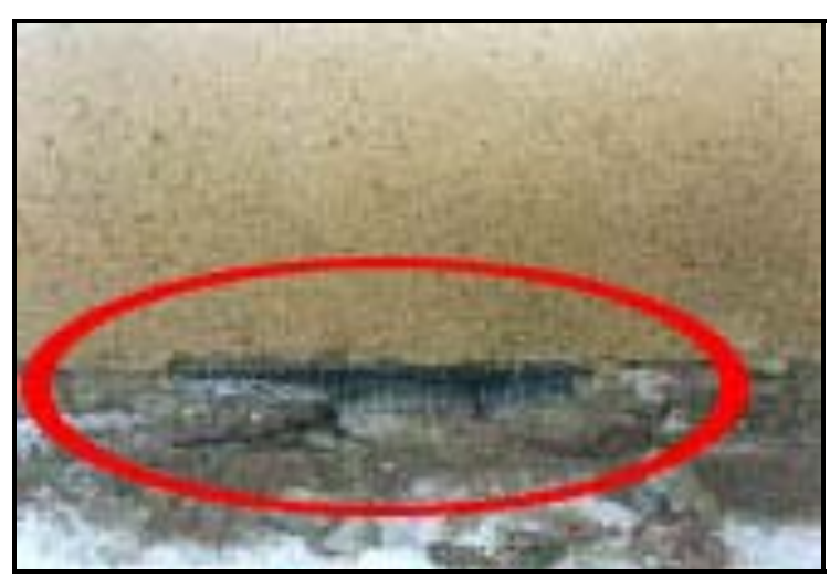
Fold lath metal and place in holes in the foundation of houses