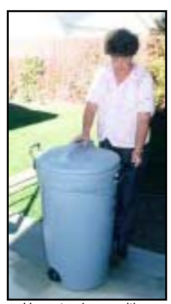
Use a trash can with a tight lid