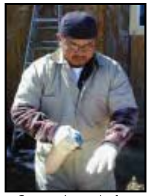
Spray gloves before taking them off