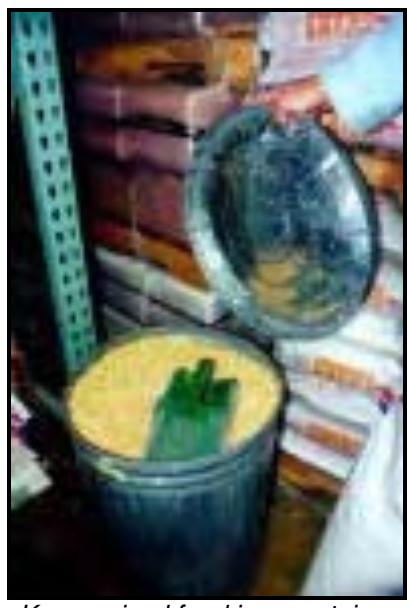
Keep animal feed in a container with a tight lid