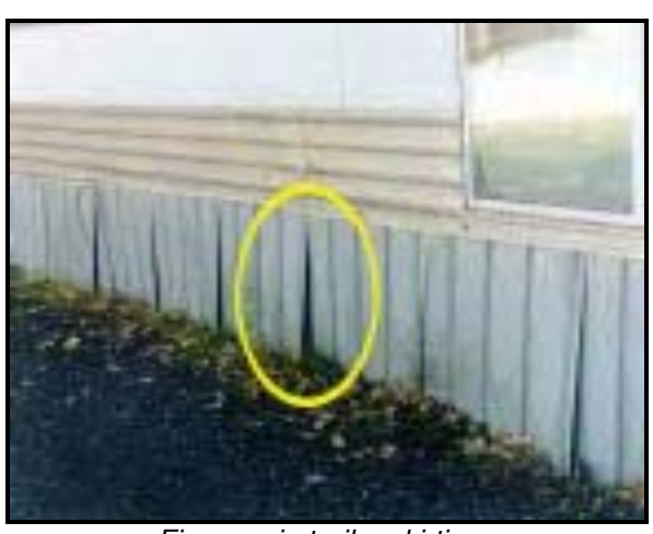
Fix gaps in trailer skirtings