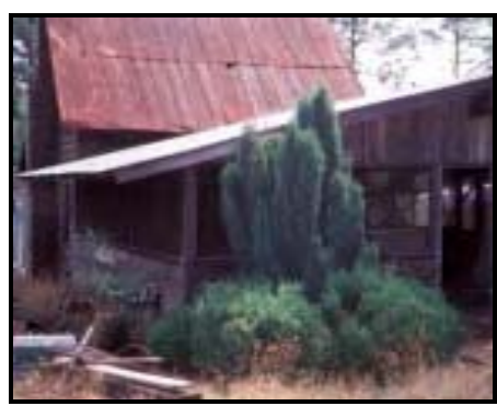
Air out cabins