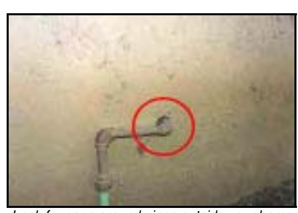
Look for gaps around pipes outside your home