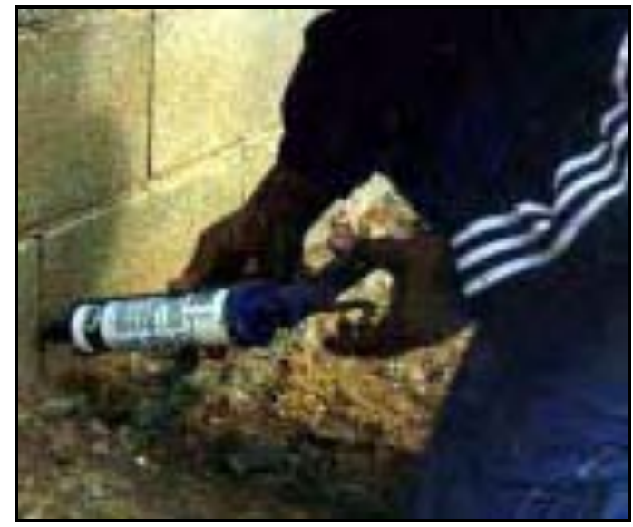
Seal holes with caulk