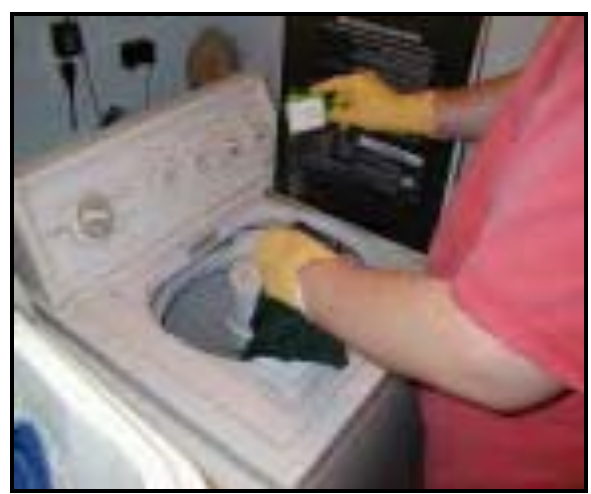
Wash clothes and bedding with detergent in hot water