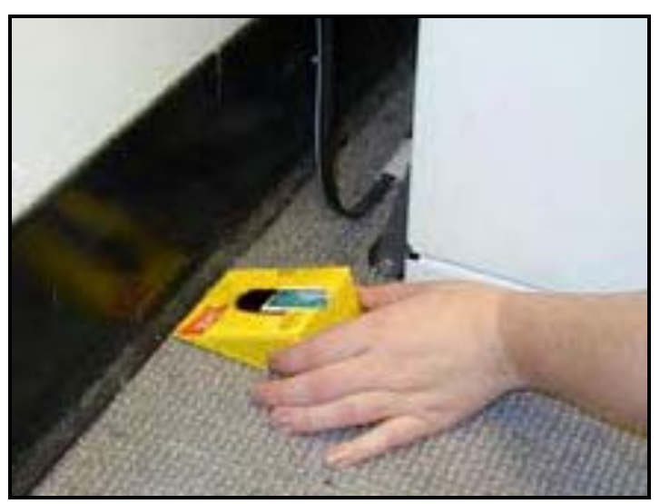
Place bait where you have seen mice or rats