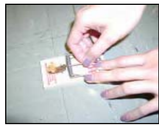
Use peanut butter on traps.