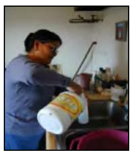
Bleach and water solution

Do not sweep or vacuum up mouse or rat urine, droppings, or nests. This will cause virus particles to go into the air, where they can be breathed in.