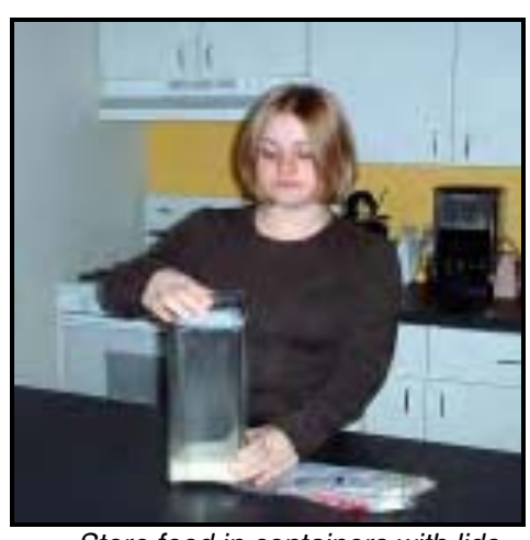
Store food in containers with lids.

Inside your home, use snap traps baited with peanut butter.